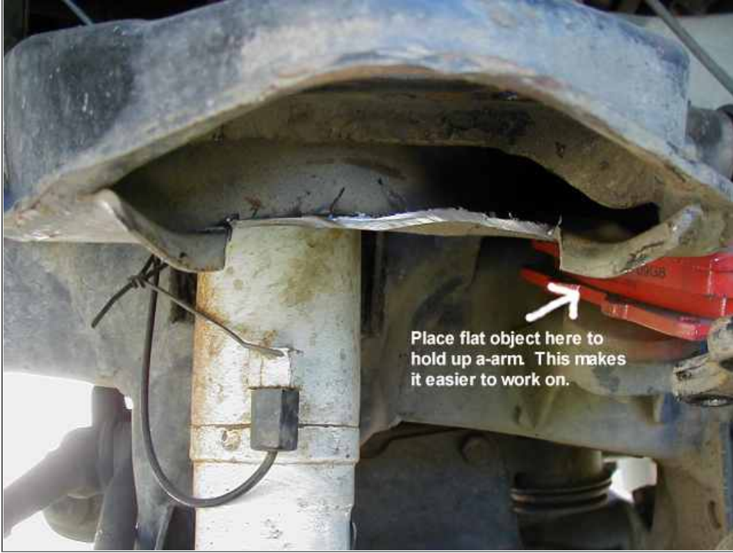
Trimming around upper ball joint