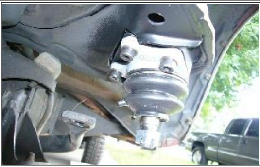
Closeup of trimmed upper control arm.