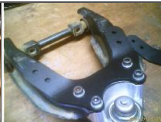
C: Upper Control Arm Brace