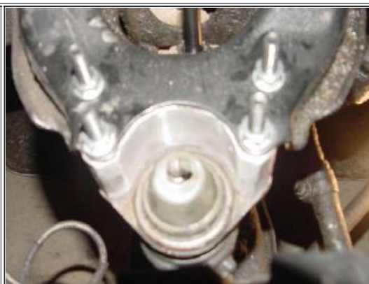
B: Spacer and Ball Joint Reinstalled