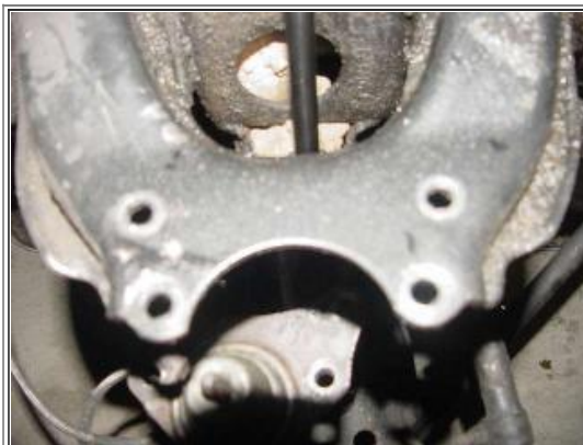
A: Upper Ball Joint removed