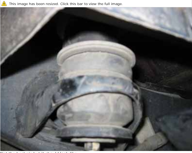
Not the best pic but it should look like

Crank the jack until you can slide a block in between the vehicle body and the existing factory rubber mounts. Pop the block in, then drop the new bolt (w/ new washer on top side) through and with the existing washer and a new bolt tight