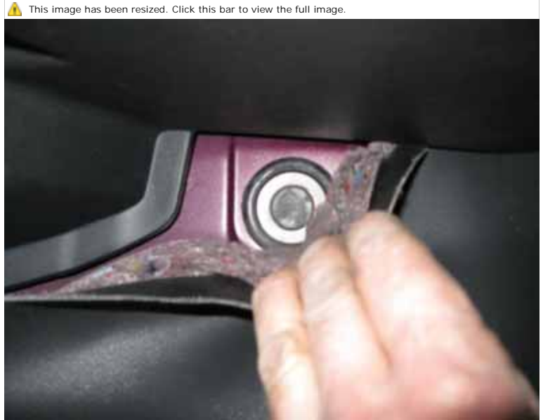
The last one is accessible from behind the cargo area trim. Remove your jack/tools cover and you will see the grommet passenger side is as easy as removing the inverter trim and it is behind that.