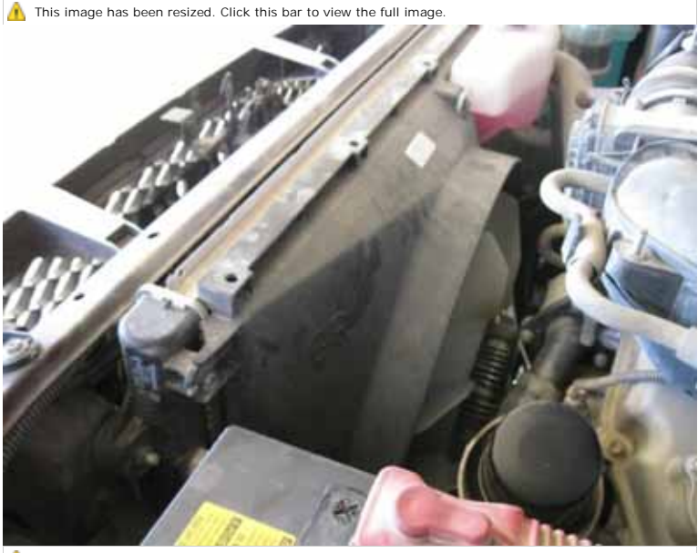
🦍 This image has been resized. Click this bar to view the full image