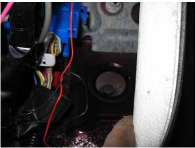
The 3rd one is next to the rear seat. Fold the base of the seat up against the fornt seats, and from where the child resti floor covering out from under the plastic side trim. The grommet and bolt hole wil be exposed in the corner of the floor.