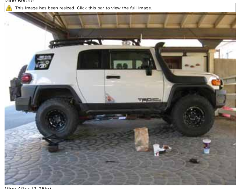
Mine After (1.25in)