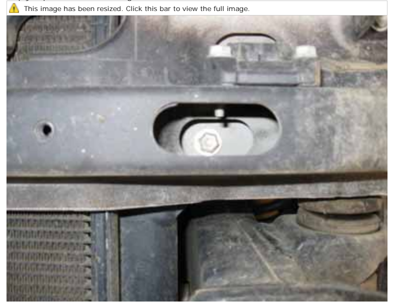
Tighten these support brackets and reinstall your fan shroud and overflowe bottle, and double check to make sure your radiator, or shroud.

Slide the drop brackets in so the hex bolt goes through the rubber mount and the stud through the original support hol them, you may have interference issues with a nut located on the front bib panel. If you do, you can cut it off or install stop you plastic radiator hitting the nut.