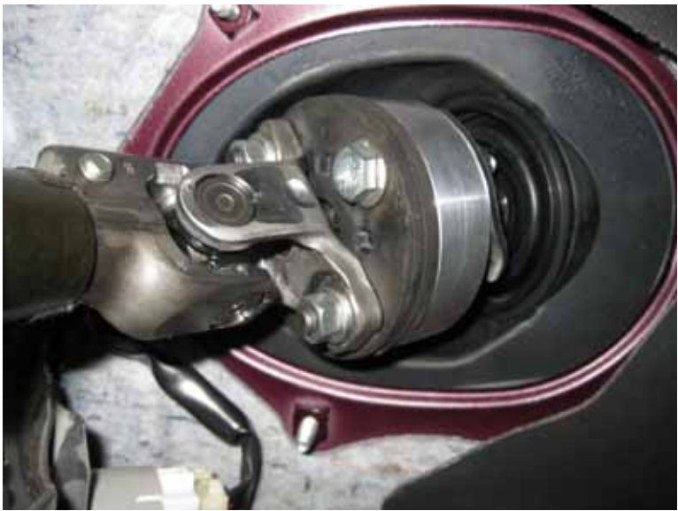
Tighten it good and then proceed to the steering slip joint at the firewall which you loosened earlier and tighten it back

You can now reinstall all your interior.